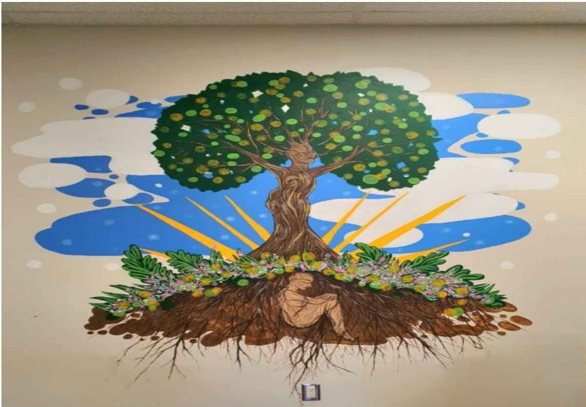
Mural was completed in Partnership with Art Windsor-Essex

Thank you to all those who submitted applications and we encourage you to continue your journey in recovery.